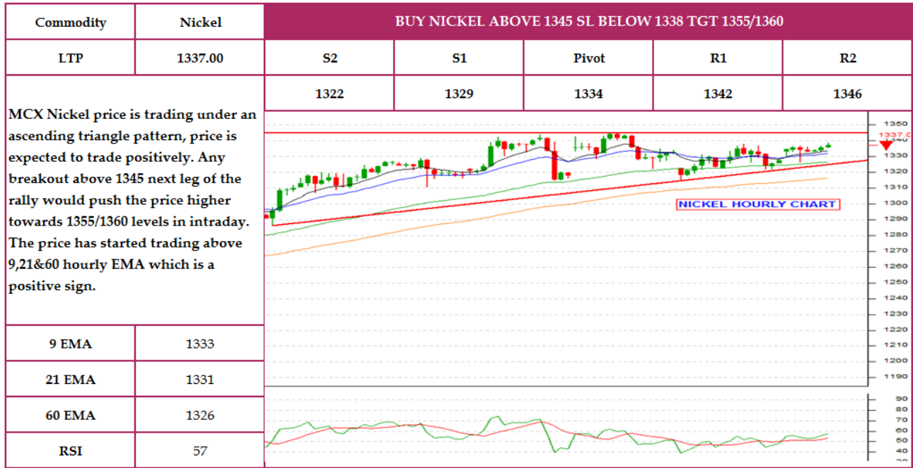
Chart of the days